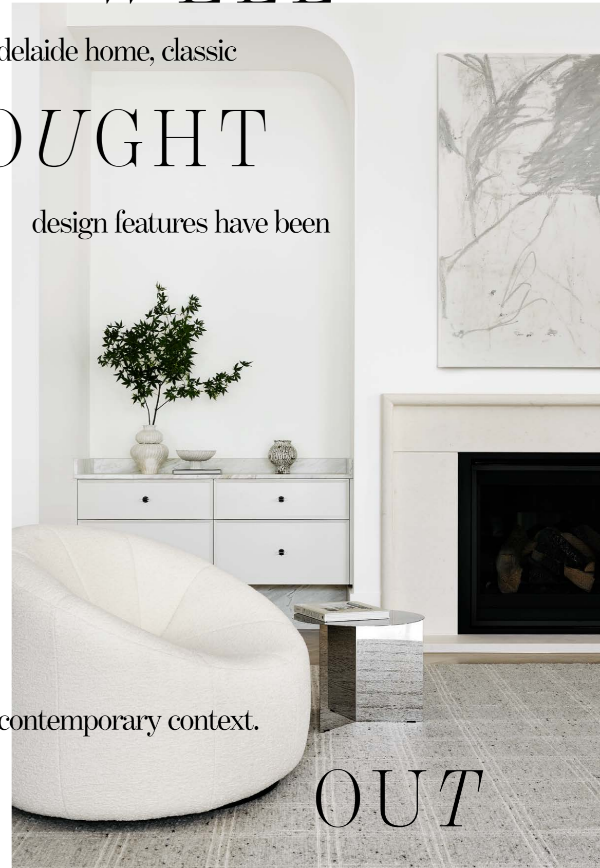
Words CARLI PHILIPS Styling RACHEL LEPPINUS