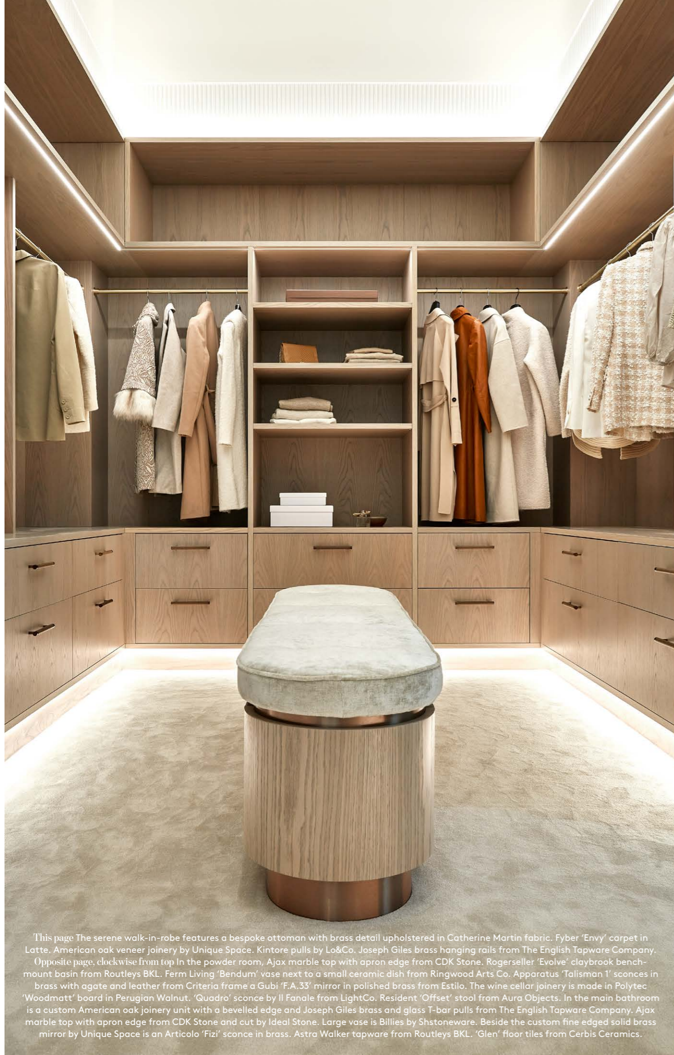
This page The serene walk-in-robe features a bespoke ottoman with brass detail upholstered in Catherine Martin fabric. Fyber 'Envy' carpet in Latte. American oak veneer joinery by Unique Space. Kintore pulls by Lo&Co. Joseph Giles brass hanging rails from The English Tapware Company. Opposite page, clockwise from top In the powder room, Ajax marble top with apron edge from CDK Stone. Rogerseller 'Evolve' claybrook benchmark basin from Routleys BKL. Ferm Living 'Bendum' vase next to a small ceramic dish from Ringwood Arts Co. Apparatus 'Talisman 1' sconces in brass with agate and leather from Criteria frame a Gubi 'F.A.33' mirror in polished brass from Estilo. The wine cellar joinery is made in Polytec 'Woodmatt' board in Perugian Walnut. 'Quadro' sconce by Il Fanale from LightCo. Resident 'Offset' stool from Aura Objects. In the main bathroom is a custom American oak joinery unit with a bevelled edge and Joseph Giles brass and glass T-bar pulls from The English Tapware Company. Ajax marble top with apron edge from CDK Stone and cut by Ideal Stone. Large vase is Billies by Shstoneware. Beside the custom fine edged solid brass mirror by Unique Space is an Articolo 'Fizi' sconce in brass. Astra Walker tapware from Routleys BKL. 'Glen' floor tiles from Cerbis Ceramics.